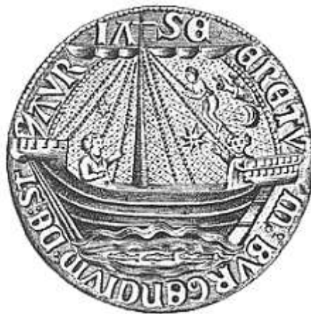
Representation of a Ship with forecastle and poop deck, preserved on an old seal of Staveren.

Tartara råwed. Tha Tartara sênd en dêl fon Findas slachte ænd althus thrvch tha Twisklandar hêten vmbe thæt hja nimmerthe nêen frêtho wille, men tha mænniska alti út tarta to strydande. Forth gvng hju æftera Saxnamarka tweres thrvch tha ôra Twisklanda hin, allerwêikes thæt selva ûtkêtha. Nêi twam jêr om wêron, kêem hju allingen thêre Rêne to honk. By tha Twisklandar hede hju hjara selva as Moder ûtjân ænd sêid thæt hja mohton as fry ænd franka mænniska wither kvma, men thæn mosten hja ovir tha Rêne gvngga ænd tha Gola folgar út Fryas sûdarlandum jâgja. As hja thæt dêde, sa skolde hjra kêning Askar overa Skelda gvngga ând thêr thæt land ofwinna. By tha Twisklandar send fêlo tjoda plêga fon tha Tartarum ænd Mâgjara binna glupt, men âk fûl send thêr fon vsa sêdum bilêwen. Thêr thrvch hævath hja jeta fâmnâ thêr tha bern lêra ænd tha alda rêd jeva. Bit-anfang wêron hja Reintja nydich, men to tha lesta wærth hju thrvch hjam folgath ænd thjanjath ænd allerwêikes bogath, hwêr-et nette ænd nêdlik wêre.